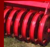
« U » roller Ø 500 mm