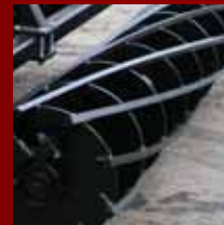
Crumbler roller Ø 500 mm