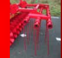
Triple harrows Ø 14 or 16mm