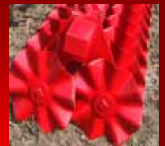
Twin roller Ø 500 mm