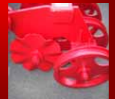
Twin & U roller Ø 500 mm