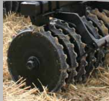
Emopak Profile « flat »

For sticky conditions, a rubber roller "Flexpak" with a diameter 740 mm is available.